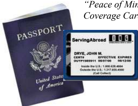
"Peace of Mind" Coverage Card